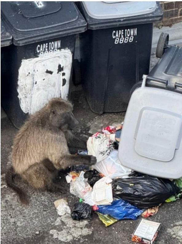
Our visitor "skorelling" in the bins, reportedly from Heatherton on Main Road.

It's not every day that our suburban streets play host to a visitor from the wilder parts of our city, but that's exactly what happened on the morning of Friday, 20 June. Local WhatsApp groups were abuzz with reports of a young male baboon wandering through Kenilworth. While not an unusual sight in areas closer to the mountain, his appearance here was certainly a rare and thrilling experience for the residents who spotted him.